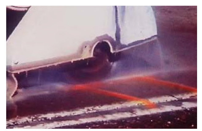
Figure 3. Diamond . bladed saw for Sawing & Chipping

<u>4.3.2 Carbide Milling.</u> Some States have successfully used carbide _tipped milling machines for PDR. Use a milling machine with a kilowatt rating on the high _end for its class. Milling machines with 12 to 18" (300 - 450 mm) wide cutting heads have proven efficient and economical, particularly when used for large area. To prevent excessive removal and damage to dowel bars, the machine must have a mechanism that will limit penetration of the milling head to a preset depth. Depending on the equipment and the lane closure conditions, the milling machines can operate either across lanes or parallel to the pavement centerline. Milling across lanes is effective for spalling along an entire joint. For smaller, individual spalls, either orientation is effective. Periodically check the milling head for missing teeth and replace as needed.