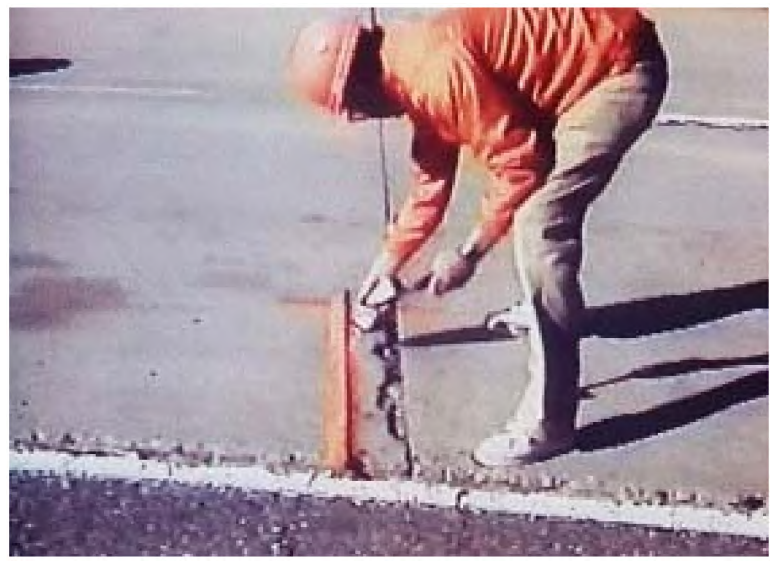
Figure 2. Marking Area for Removal