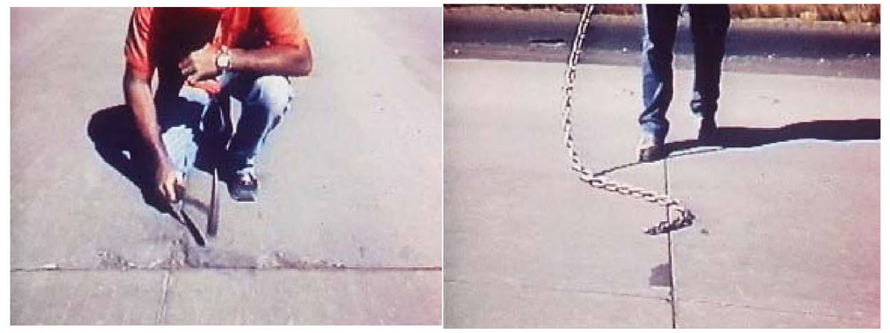
Figure 1. "Sounding" with ball _ peen hammer (left) and steel chain (right)

The first step in a successful PDR is the identification and removal of all deteriorated concrete. Unsound concrete is commonly located by "sounding out" the delaminated area. Sounding is done by striking the concrete surface with a steel rod or ball _peen hammer, or by dragging a chain along the surface. The rod, hammer, and chain will produce a clear ring when used on sound concrete and a dull response on deteriorated concrete. In addition to sounding, coring may also be used to find deterioration.