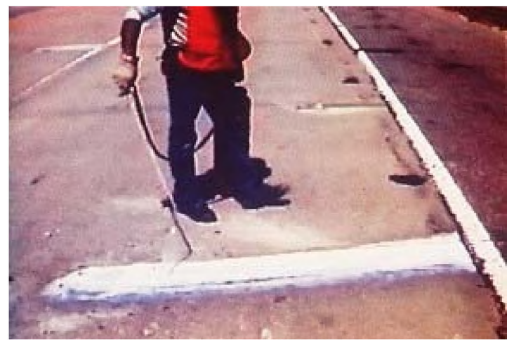
Figure 9. Application of Curing Compound

Apply a liquid _ membrane _ forming curing compound evenly and sufficiently. Use well _ maintained pressure spraying equipment that will allow an even application. An application rate of about 5.0 m /liter is sufficient. Where early opening of the pavement to traffic is required, it maybe beneficial to place insulation mats over the repairs. This will hold in heat from hydration and promote increased strength gain for cementitious materials.