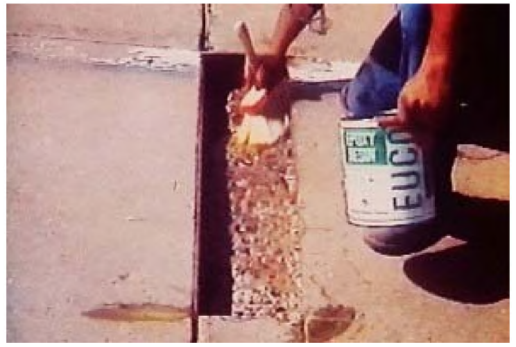
Figure 8. Application of Bonding Agent

Check the repair area for any dust or sandblasting residue before placing a bonding agent. The area should be clean and dry. Wiping the area while wearing a dark brown or black cotton glove will easily indicate a dust problem. Airblow again if the dust has settled back in the repair area. Once clean, apply a thin, even coat of bonding agent over the entire patch area, including the repair walls or edges. Contact time for cement grout should not exceed about 90 minutes, and it must not dry before the placement of the repair material. Scrubbing the bonding materials in with a stiff _ bristled brush works well to get the materials into surface cavities. Epoxy agents may permit a less vigorous application. Overlapping the pavement surface also will help promote good bonding.