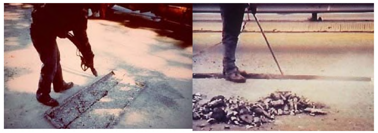
Figure 5. Left: Sand Blasting of Repair Areas. Right: Airblow to Remove Dust and Debris.

Airblow the repair area to remove dust and blast residue. Direct the debris away from the repair area so that wind and traffic will not carry it back. Dust and dirt prevent the repair material from bonding to the old concrete. The air compressor should deliver air at a minimum of 2.6 yd <sup>3</sup> (3.4 m<sup>3</sup>) per minute and develop 90 psi (0.63 MPa) nozzle pressure. Even if the equipment has a filter, check the air for oil and moisture contamination that could prevent bonding between the repair material and existing concrete. Place a clean cloth over the nozzle and blow air through the cloth, and examine it for any discoloration from contamination.