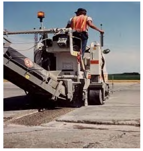
Figure 4. Milling Operation

<u>4.3.2 Carbide Milling.</u> Some States have successfully used carbide _tipped milling machines for PDR. Use a milling machine with a kilowatt rating on the high _end for its class. Milling machines with 12 to 18" (300 - 450 mm) wide cutting heads have proven efficient and economical, particularly when used for large area. To prevent excessive removal and damage to dowel bars, the machine must have a mechanism that will limit penetration of the milling head to a preset depth. Depending on the equipment and the lane closure conditions, the milling machines can operate either across lanes or parallel to the pavement centerline. Milling across lanes is effective for spalling along an entire joint. For smaller, individual spalls, either orientation is effective. Periodically check the milling head for missing teeth and replace as needed.