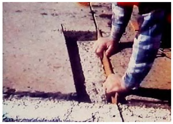
Figure 7. Joint Insert